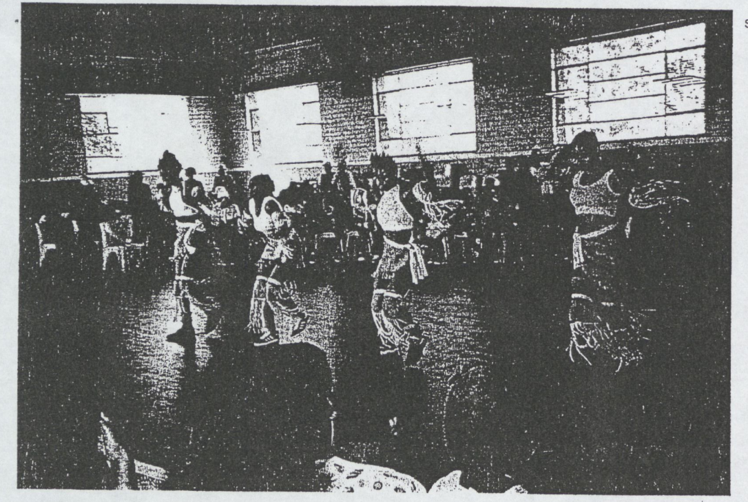
Soweto Dance Theatre.

Workshop Programme headed by a contingency of top local and international artists and traditional exponents.